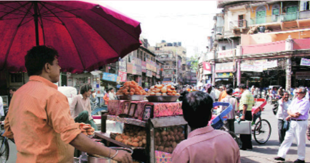
A fruit seller selling fruits on a street in Delhi

In April 2014, the municipal corporations of Delhi issued public notices banning street vendors from selling food and fruit juice. It also enforced stringent guidelines which barred vendors without licenses from doing business.