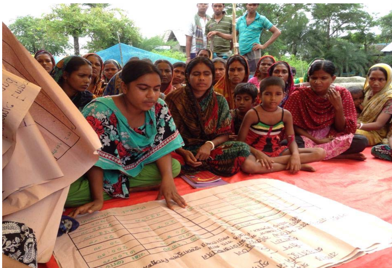
Women Crab Farmer Group meet in Southern Bangladesh © Janice Ian Manlutac